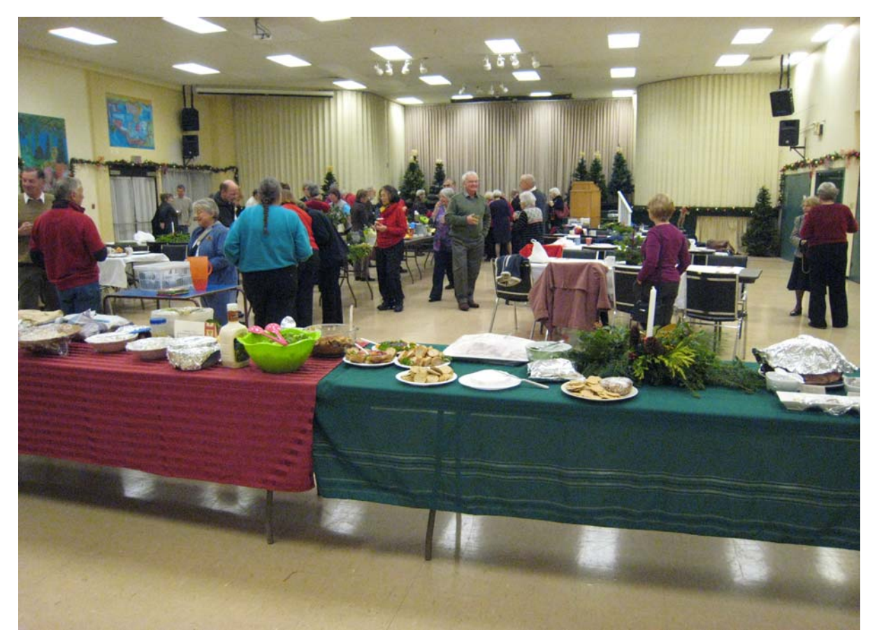
The Christmas Pot Luck Dinner, December 6, 2010.