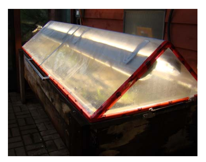
A typical propagation box

Bill McMillan 250-478-3515 Calvin Parsons 250-385-1970